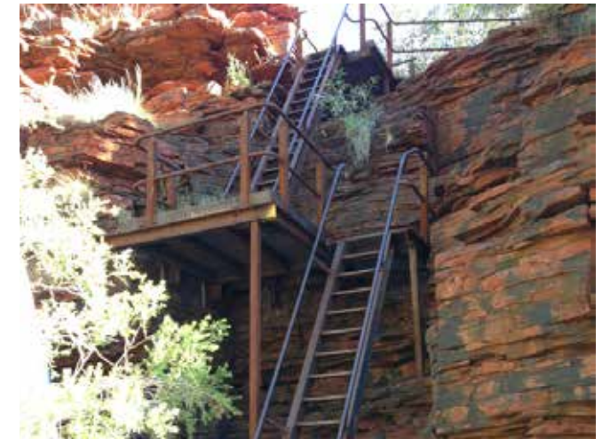
Hancock Gorge ladders

The trail ends at Kermits Pool. Do not proceed beyond this point. Penalties apply. For enquiries, contact park staff.